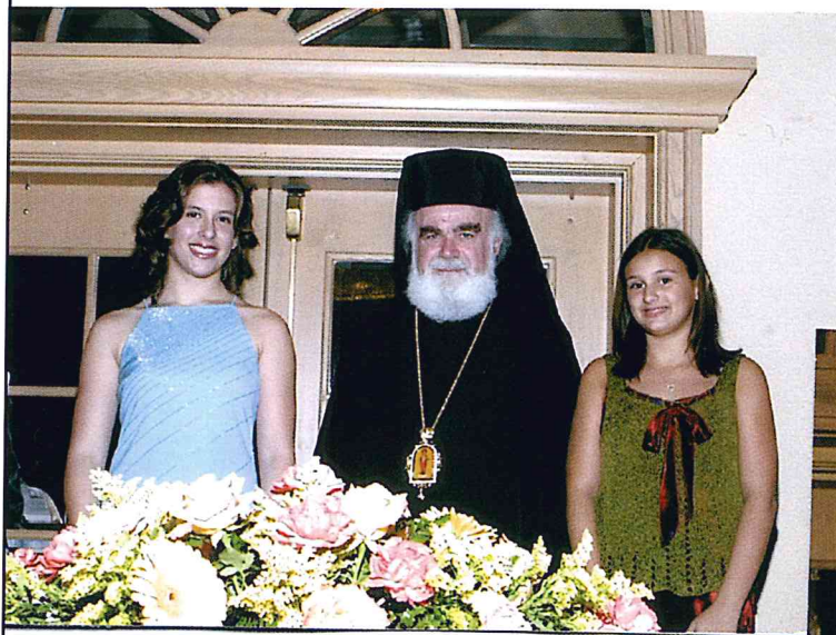
Grand Banquet & Dance