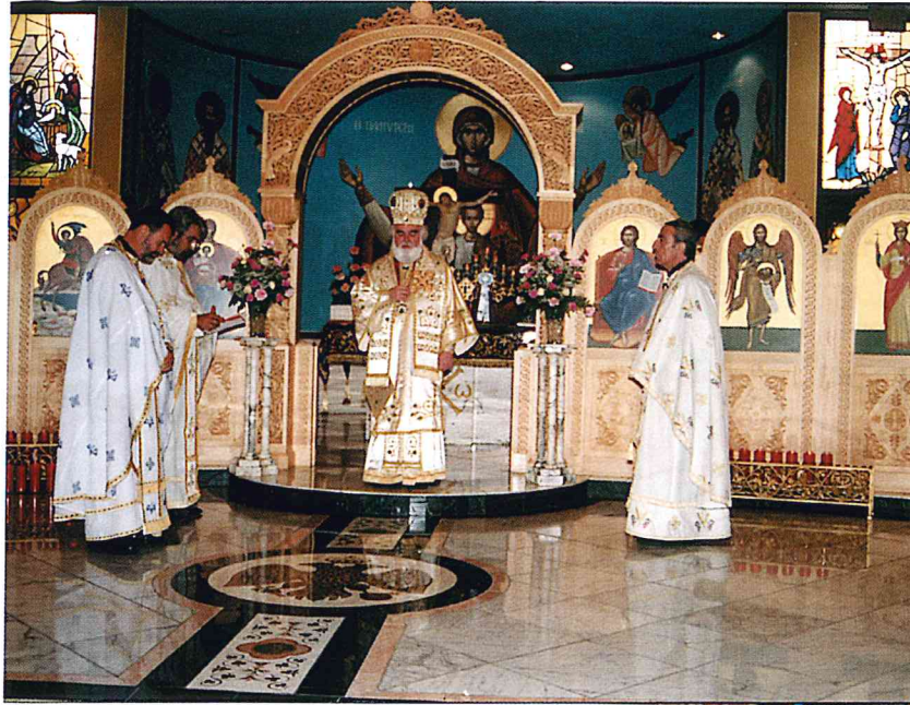
St. Demetrios Day Services