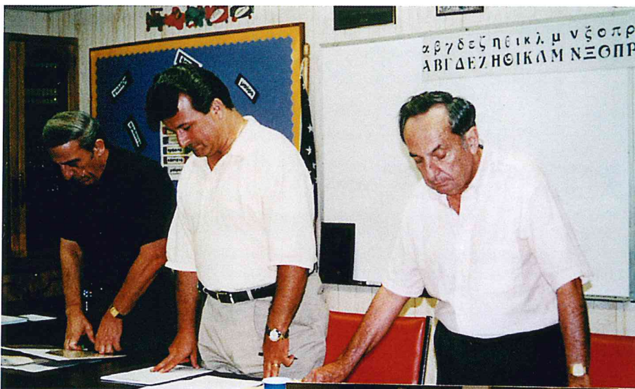
Weekly Committee Workshop