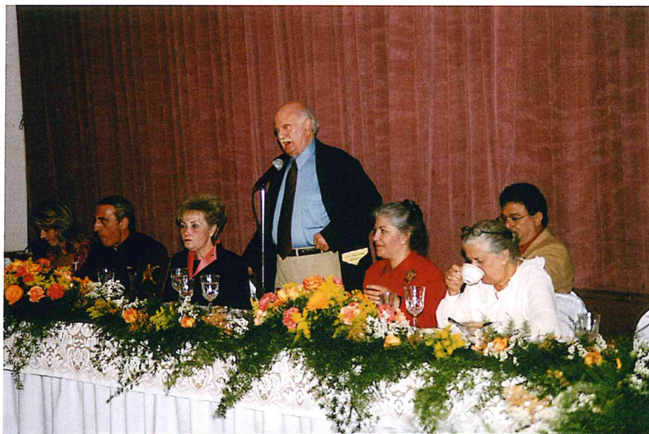
Luncheon sponsored by the Philoptochos