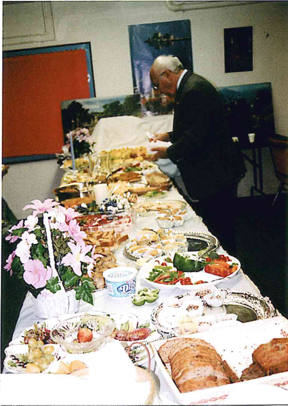
Reception after Vesper Services