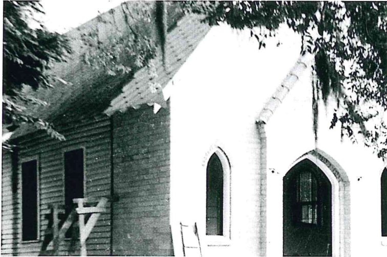
Workers from D.W. Browning Plumbing and Heating